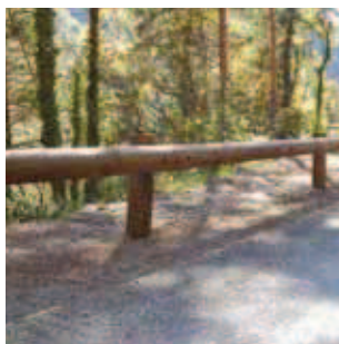
Diameter 18 cm round log, backed with a steel U channel