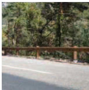
C100 steel post in 1.50 m length covered with wood. Tensioner system